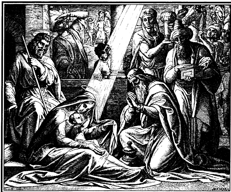
Julius Schnorr von Carolsfeld (1794-1872) 'The Visit of the Wise Men' woodcut

Please join in singing the Ordinary of the Mass: