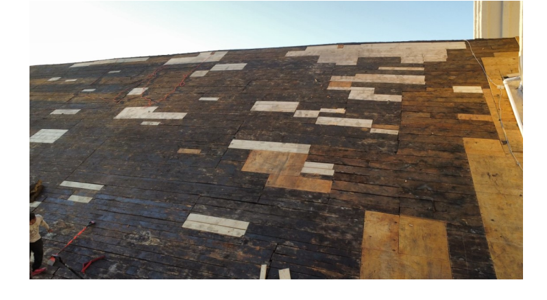
Below, all rotten lumber is removed and replaced.

Right, the roof is now covered with a layer of plywood and a weather barrier prior to the installation of the new metal panels.