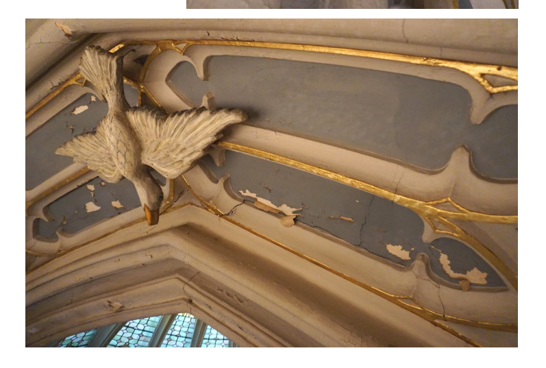
(Below) The dove at the apex of the great arch is surrounded by failing paint 52 feet above the sanctuary.

(Below) Paint is flaking and plaster is spalling on the great arch between the nave and the sanctuary