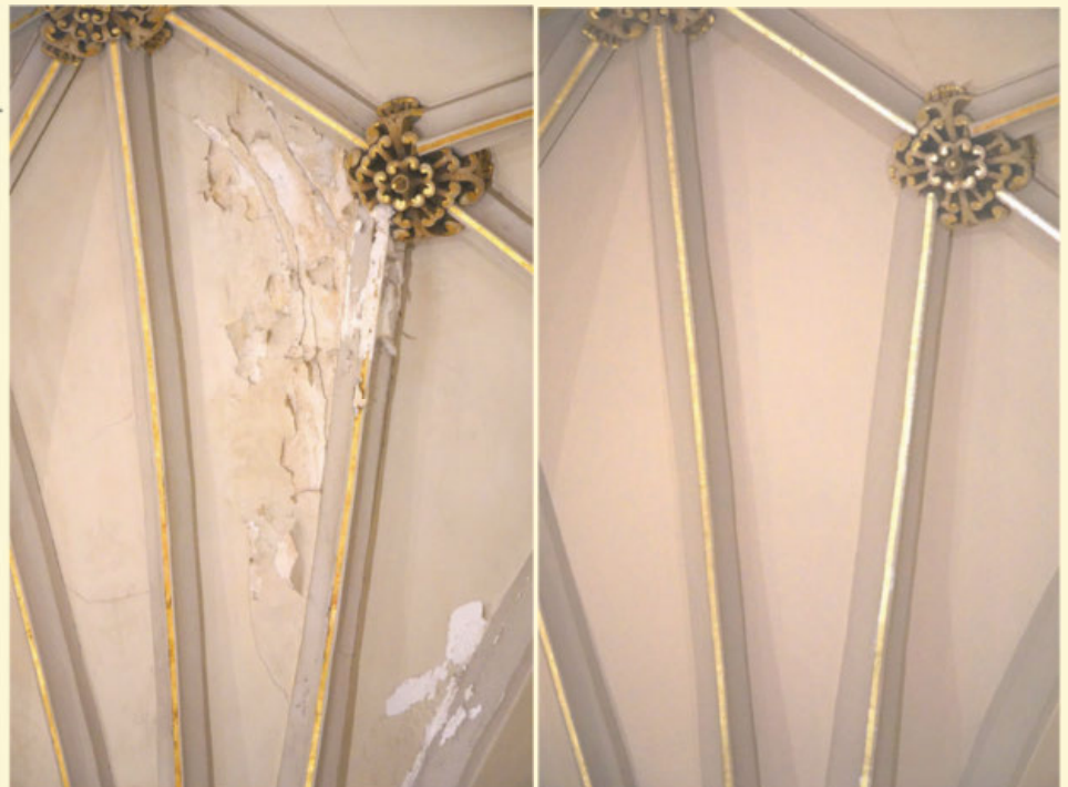
St. Patrick's Church Ceiling Before St. Patrick's Church Ceiling After (August 2022)