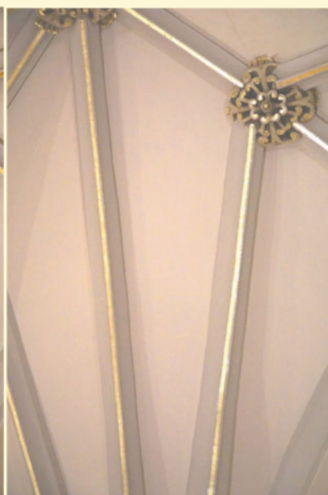
St. Patrick's Church Ceiling After (November 2022)