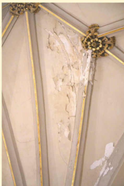
St. Patrick's Church Ceiling Before (August 2022)