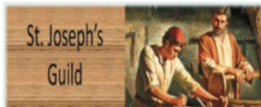
St. Joseph's Guild