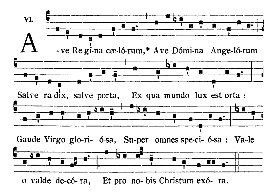
Hail, O Queen of the heavens! Hail, O mistress of the angels: Hail, Root [of Jesse]! Hail, Gate whence arose the Light upon the world: Rejoice, O glorious Virgin, lovelier than all others, Farewell, O most beautiful, and pray for us to Christ.