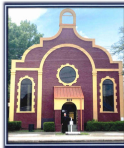
St. Francis de Sales Oratory Institute of Christ the King 802 South Huntington St. Sulphur, La 70685

THE SECOND COLLECTION FOR THIS WEEK AT ST. PATRICK'S WILL BE FOR ST. FRANCIS DE SALES INSTITUTE OF CHRIST THE KING IN SULPHUR, LOUISIANA