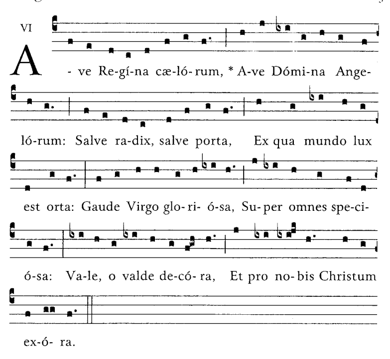
Hail, O Queen of the heavens! Hail, O mistress of the angels: Hail, Root [of Jesse]! Hail, Gate whence arose the Light upon the world: Rejoice, O glorious Virgin, lovelier than all others, Farewell, O most beautiful, and pray for us to Christ.