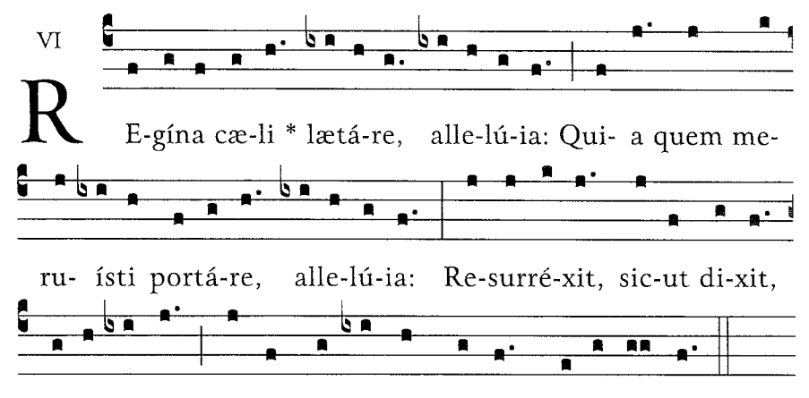
alle- lú-ia: O-ra pro no-bis De- um, alle-lú- ia.

Joy to thee, O Queen of heaven, alleluia! For He whom thou wast meet to bear, alleluia! Hath arisen, as He promised, alleluia! Pour for us to God thy prayer, alleluia! (Antiphon of Our Lady during Eastertide)